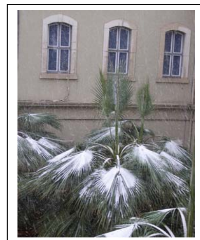
Participants awoke to snow on palm trees on the second day.

The 3rd IPTOP Congress was held in association with the Turkish Geriatric Physiotherapy Association and Hacettepe University School of Physical Therapy and Rehabilitation in Istanbul, Turkey from 3rd - 5th November 2006. The Congress venue was the Military Museum and Cultural Centre which was built in 1841, then used as a War College until 1936, with restoration completed in 1993 to become a Museum and Cultural Centre. Nearly 350 delegates from 18 countries including Australia, Brazil, Germany, Greece, Iran, Iraq, Italy, Japan, Latvia, Netherlands, Norway, Northern Cyprus, Switzerland, Taiwan, Turkey, UK and USA attended to this congress