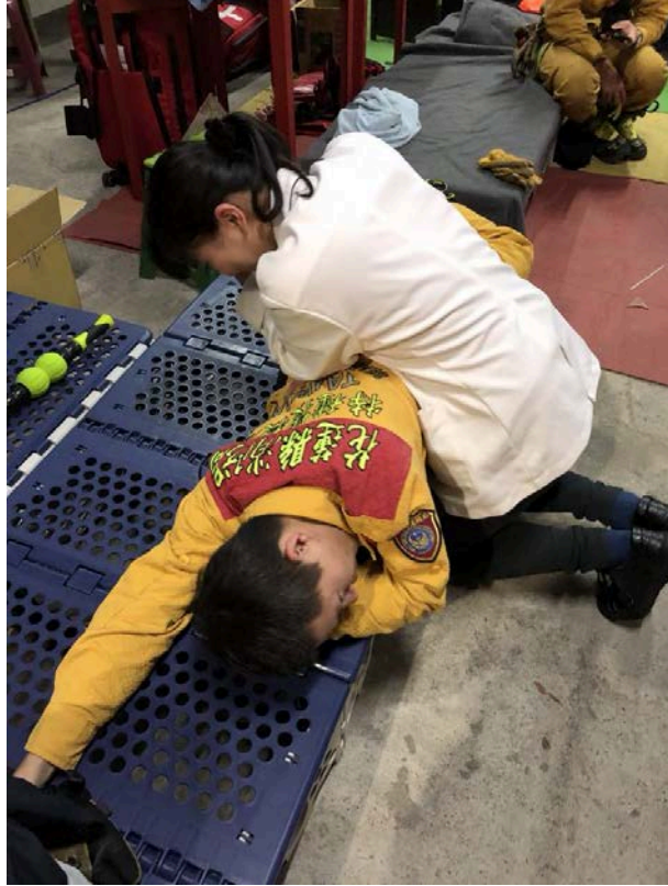
PT stretched the sore back muscles for a rescue team member.