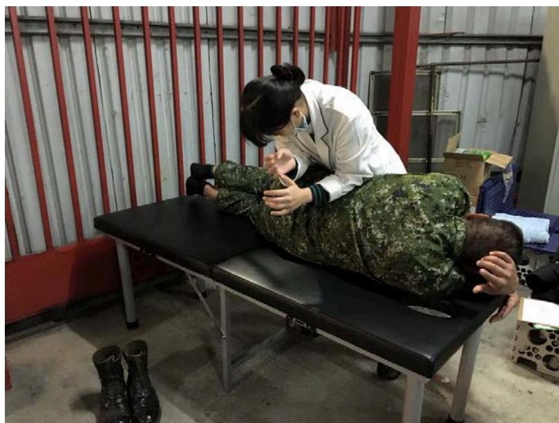
PT provided treatment for lower back pain for a military personnel of the rescue team.