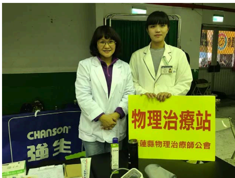
PTs at one of the shelter, based at a sport stadium.