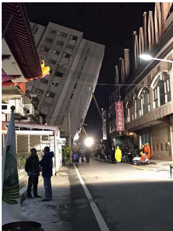
Looking out from the PT Service Station at the Rescue Base.